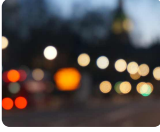
Hotel Jagjeet Mirik, West Bengal, IN