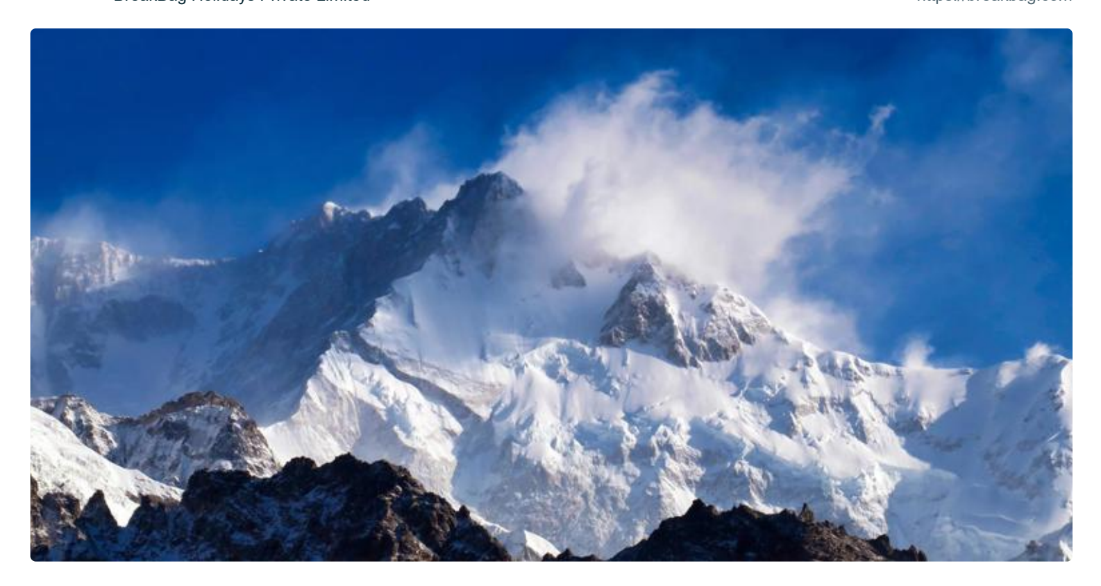
Lachen & Lachung Adventure Tour Package

+91-7699002674 support@breakbag.com https://breakbag.com